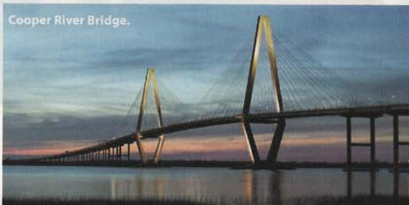
Cooper River Bridge.